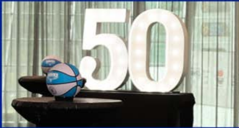
Perry Lakes Hawks 50 Years 1973-2023