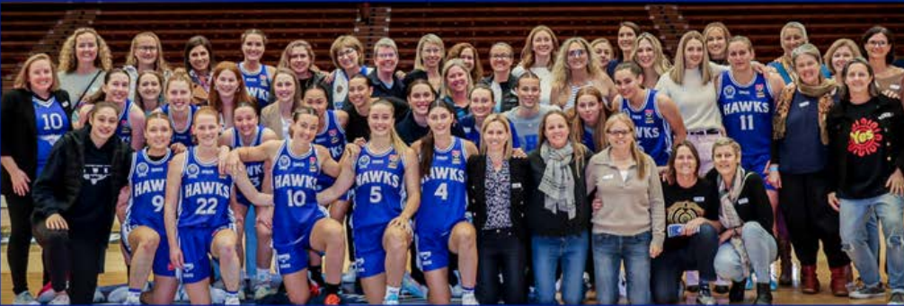
Our Past and Present Women