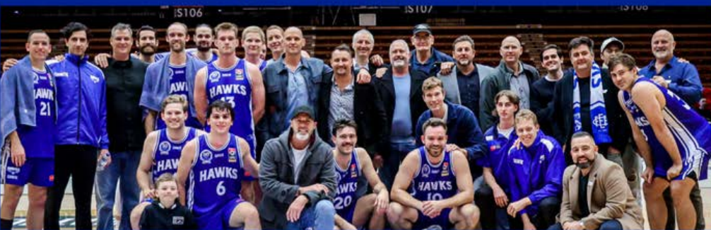
Our Past and Present Men